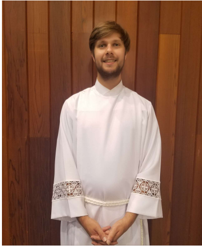
PROFESSION OF FAITH