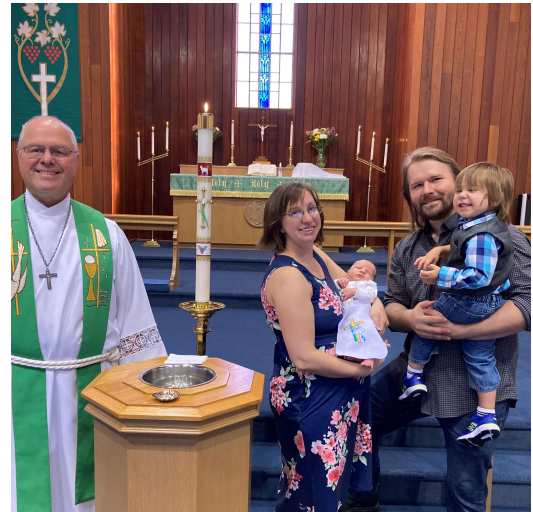
PARENTS: DUSTY & BRI LOFINK SPONSORS: SETH & NIKI MIEROW