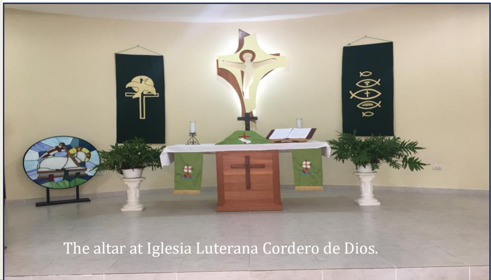
The altar at Iglesia Luterana Cordero de Dios.

To support our work financially, you may send a tax-deductible gift to: