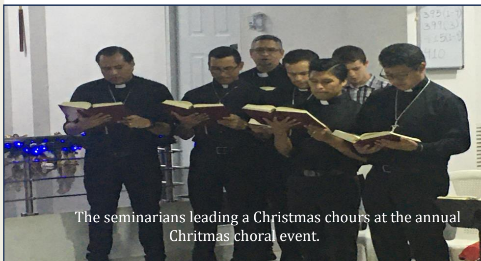
The seminarians leading a Christmas chours at the annual Christmas choral event.